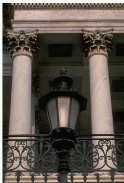
BESTHIRE: PROVIDING YOUR HR DEPARTMENT THE TOOLS TO HIRE RIGHT THE FIRST TIME

You are the HR department, the first line of defense in protecting your companies assets and employees.